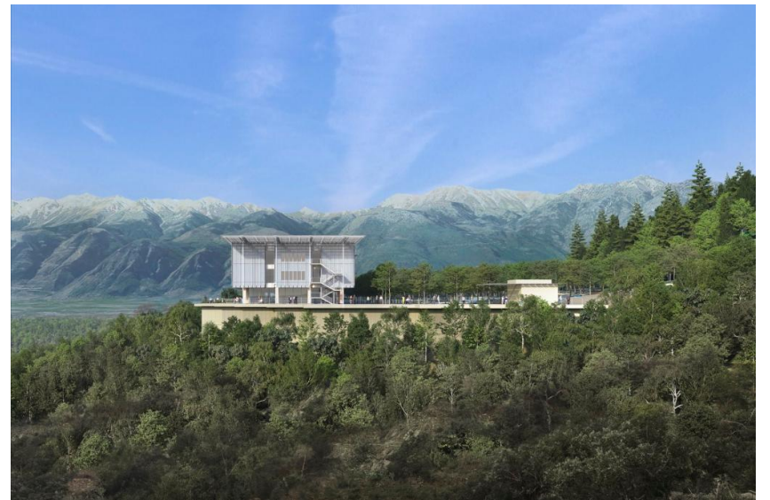
Digital representation of the new Sparta Hospital

The new Sparta Hospital will be completed in 2025 and will cost 90m euros. As Mr. Drakopoulos emphasized, "every six months the society will be informed about the progress of the project" as the Foundation team will visit the site and will inform the community about the progress of the projects.