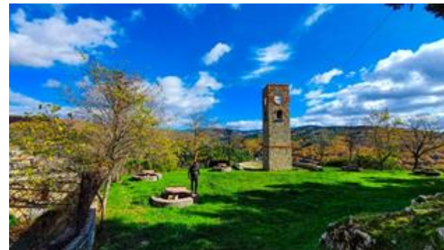
The Karyes' Municipal Clock